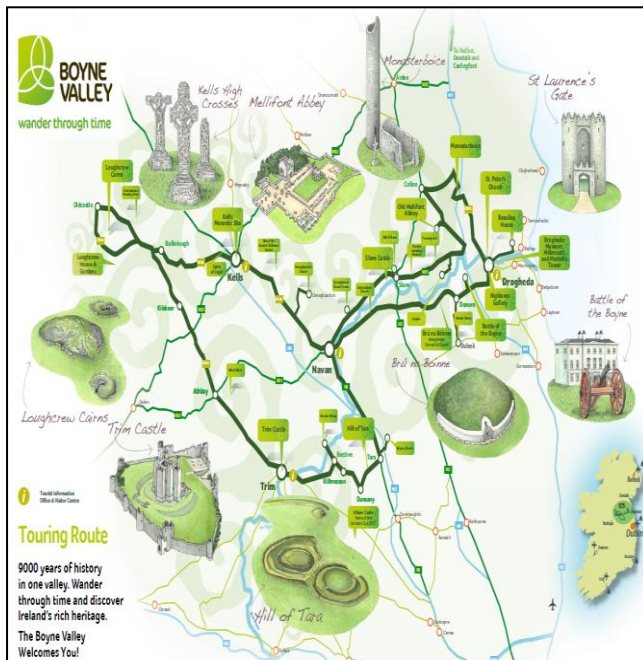
Boyne Valley Drive