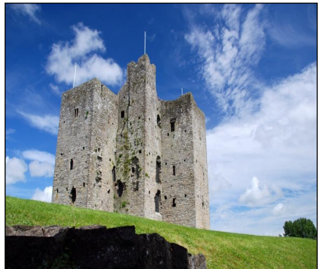
Trim Castle, Co. Meath

Meath occupies a central role in the attraction of tourists Ireland as the County hosts some of the most important sites in the Ireland's Ancient East brand.