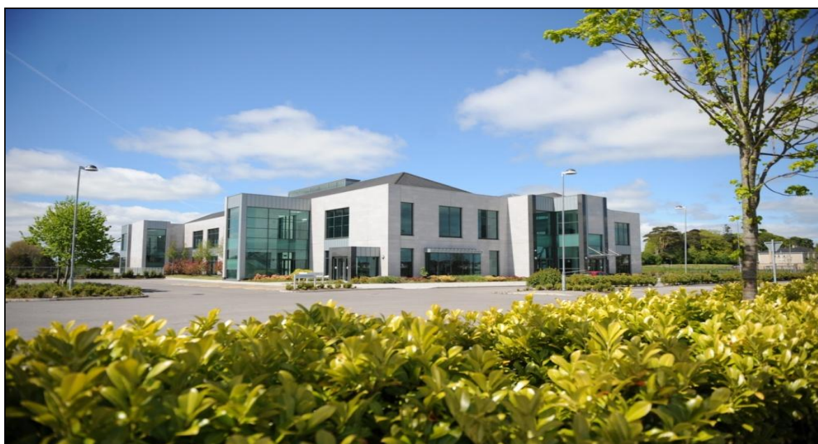
Buvinda House- Meath County Council Corporate Headquarters

As part of this process we are seeking your views on your vision for the County .